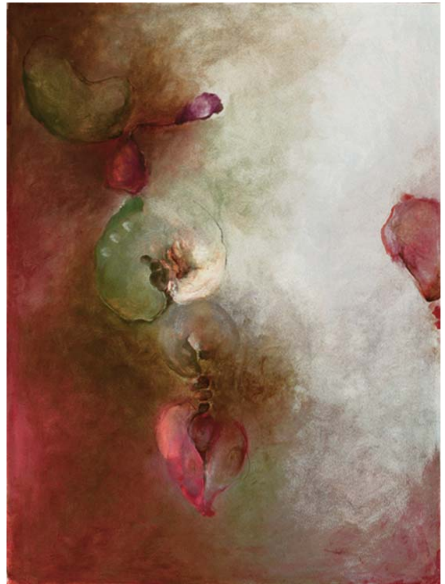
Kashgar , 40 x 30 inches, 1999, oil on canvas

After college, in 1973, she apprenticed, first with Frankenthaler, and then with Olitski and began her career as a serious painter, working with broad swaths of color indebted to color field painting. From the start her painting has been aligned with the great tradition of modern color painting that can be traced to Titian (long a favorite artist) and Venetian colore . It includes impressionism, post-impressionism, Matisse, Bonnard, and Rothko, as well as the color field painters whom she already knew well. However, she had come to color field painting late, after its parameters had been established, and while it was a fruitful point of departure for her, she could not fully embrace it. There were several qualities she had grown to dislike by the late 1970s – the plastic feel and limited textural and chromatic qualities of acrylic paints, and the over reliance on what she felt were its too-easy effects, deriving from the use of additives, gels and squeegees. She loved color and its sensuous, physical impact, but she had to look at it critically, to discover just how she could put her